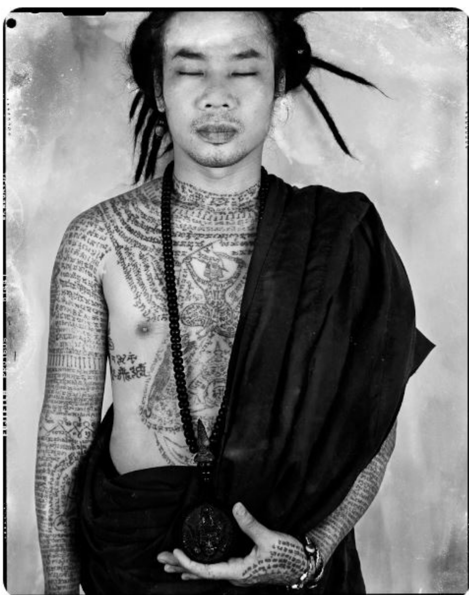
Cédric Arnold, Portrait 9 (Tattoo Master), Impression pigmentaire sur papier coton, Pigment print on cotton paper, 89 x 73 cm, 35 x 29 in.